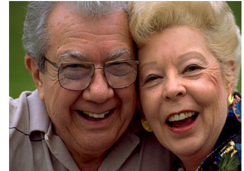
Family members and friends are always welcome to visit. Children and pets, too!

Once relieved of the stress of 24-hour care giving, family members often find the quality of their time with their loved one is much improved. Although our staff will try hard to be a second family, we realize that no one can take your place.