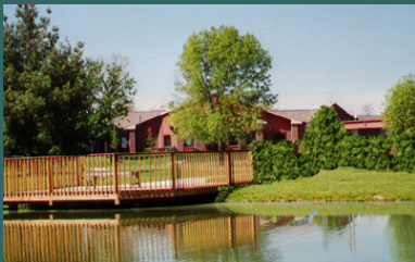
Ohio Valley Manor Nursing & Rehabilitation Center 5280 Rts. 62-68 Ripley, OH 45167